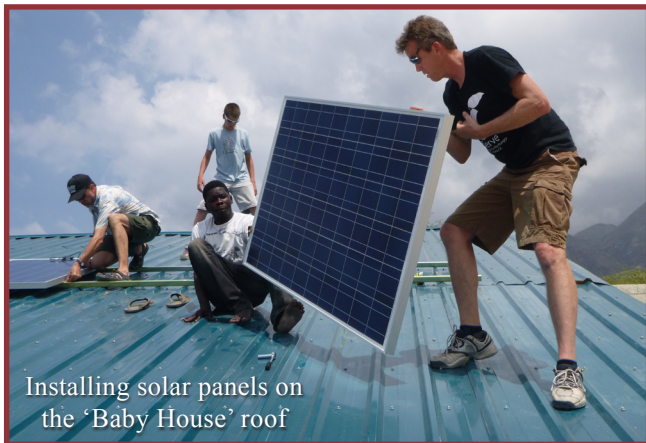
Installing solar panels on the 'Baby House' roof

Together, we all make a difference as we go, give and pray. Thank you!