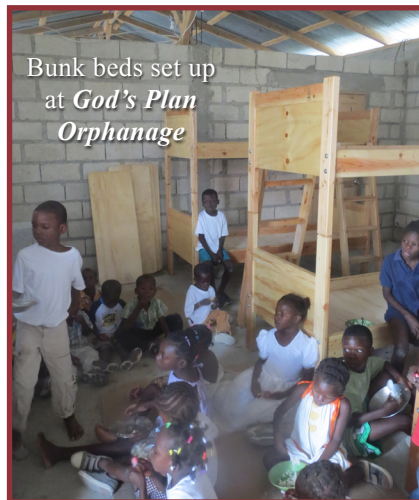
Bunk beds set up at God's Plan Orphanage