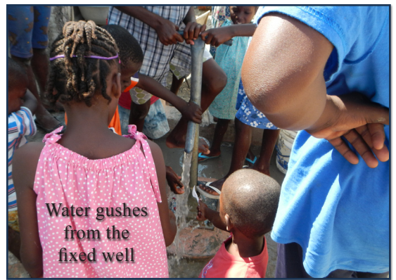
Water gushes from the fixed well