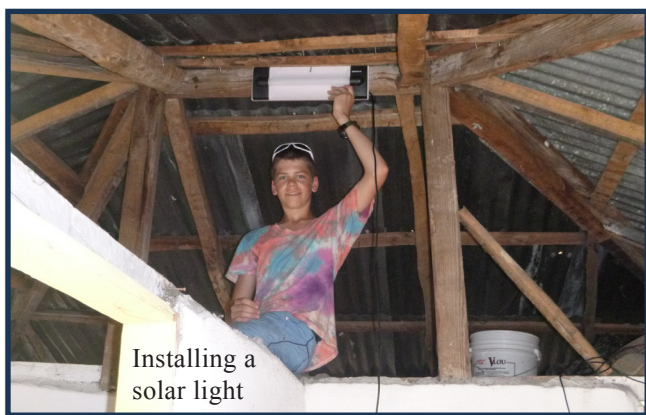
Installing a solar light

"And if anyone gives even a cup of cold water to one of these little ones who is my disciple, truly I tell you, that person will certainly not lose their reward." Matt. 10:42