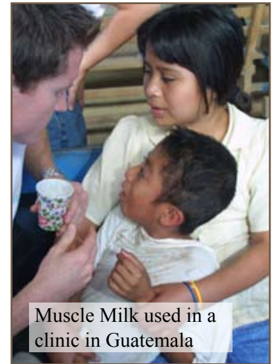
Muscle Milk used in a clinic in Guatemala