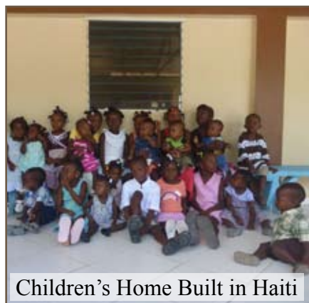
Children's Home Built in Haiti