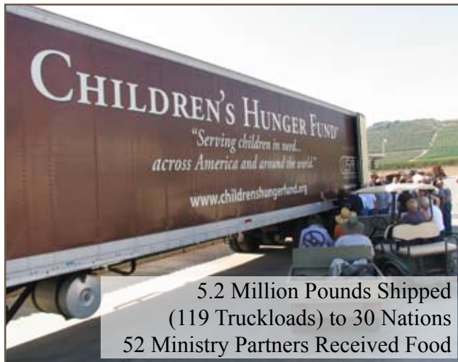
5.2 Million Pounds Shipped (119 Truckloads) to 30 Nations 52 Ministry Partners Received Food