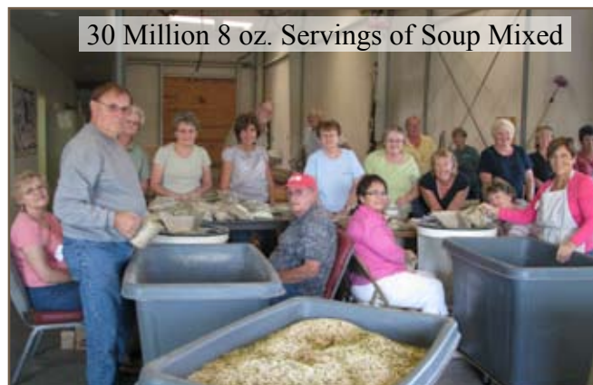
30 Million 8 oz. Servings of Soup Mixed

We are grateful to God for over 2,000 volunteers, and the Gleanings ' staff, who diligently served to make this all possible!