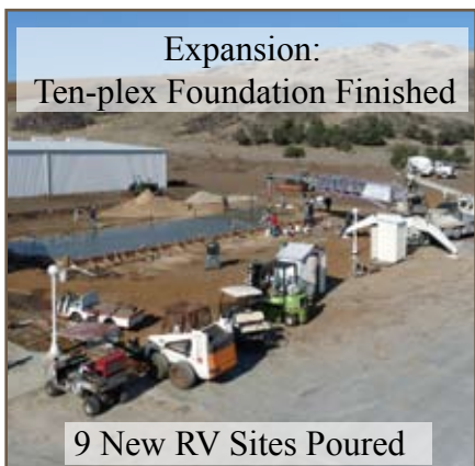
Expansion: Ten-plex Foundation Finished

THE LORD HAS DONE GREAT THINGS FOR US, AND WE ARE FILLED WITH JOY. Psalm 126:3