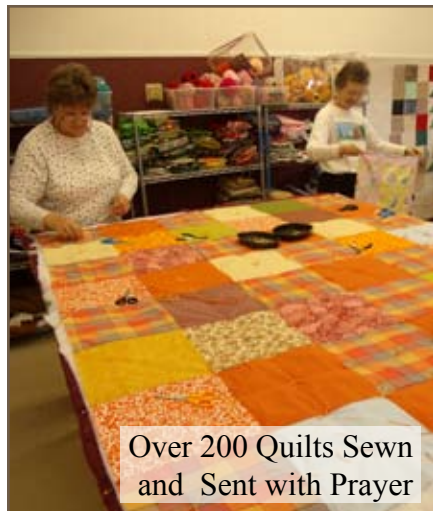
Over 200 Quilts Sewn and Sent with Prayer