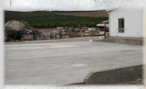
cement pad for new silos

We normally have a break in the change of season between Summer and Fall. We put the bunk beds away and transform the campus to be ready to make soup and quilts. This also gives staff members a little down time and the opportunity to get away. This year we also worked on some big projects. We added a 100 foot turn around space to our loading dock area. We also poured the concrete pad where we will install our grain silos. Grain silos will increase our storage capacity and affect the production flow. Staff member Al Gove is the master mind behind these projects, as well as our new soup bagging machine — which will greatly increase our production capabilities.