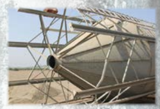
a grain silo

For the LORD is good and his love endures forever; his faithfulness continues through all generations. Psalm 100:5