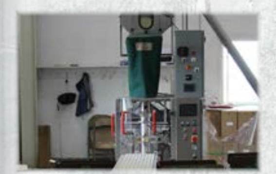
front of bagging machine

The new soup bagging machine is installed and getting its final debugging done. When in production, the machine will simultaneously make / fill / and seal bags of soup mix, using product that is auto fed into the machine from a hopper on the top. Great job Al and thanks to all who helped work on these important projects.